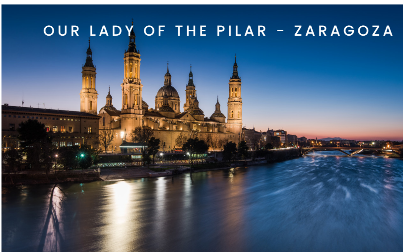
OUR LADY OF THE PILAR - ZARAGOZA